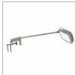
Arm reflector LED A++ 16W 1100LM 4000K EUR 35.00 Code 019.010.200.040