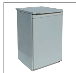
Refrigerator ARCTIC (180 l) Code 025 010 070 020 EUR 44.00