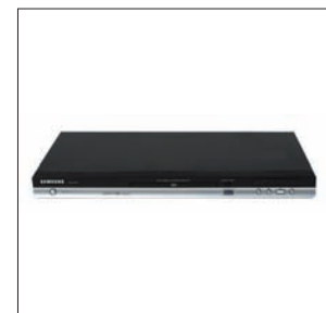
DVD Player Code 025 010 130 030 EUR 40.00