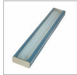
Fluorescent lighting SYMA STAR type Code 019.010.200.001 EUR 18.00