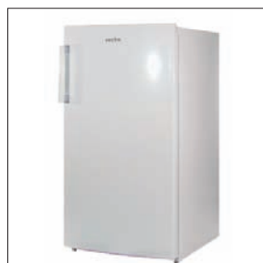
Refrigerator ARCTIC FB 155 Code 025 010 020 198 EUR 25.00