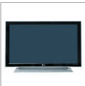
Plasma TV (diagonal screen: 107 cm) Code 025 010 130 040 EUR 25.00/day