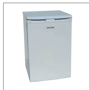
Cooler (140 l) Code 025.010.070.015 (55 x 61 x 84 cm) EUR 24.00