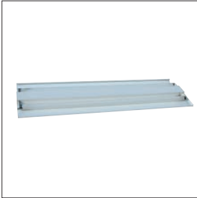
Fluorescent lighting OCTANORM type with double-tube D-171 Code 019.010.200.000 EUR 20.00