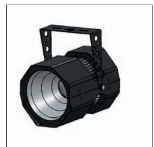
LED VIRGO reflector 40W 4350 LM 4100 K EUR 40.00 Code 019.010.200.045