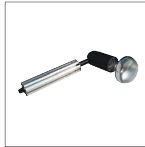
Connecting spotlight OCTANORM EUR 12.00 Code 019.010.187.000