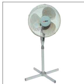
Standing fan Code 025.010.500.020 EUR 7.00