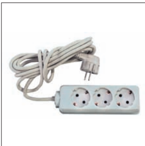
Extension cable 230V, 10A, 3m Code 019.010.277.000 EUR 10.00