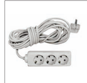
Extension cable 230V, 10A, 5m Code 019.010.279.000 EUR 10.00