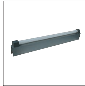
Fluorescent lighting SS30 type with D-170 tube Code 019.010.190.000 EUR 15.00