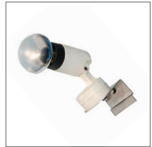
Spotlight SS30 100W EUR 12.00 Code 019.010.200.008