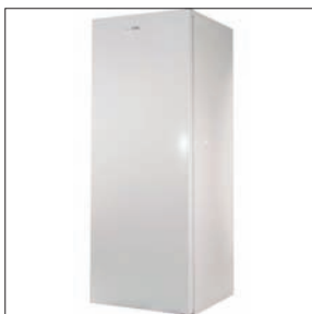
Refrigerator ARCTIC 255 l Code 025 010 020 199 EUR 55.00