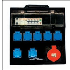
Electrical panel 380V/220V Code 019.010.265.000 EUR 100.00