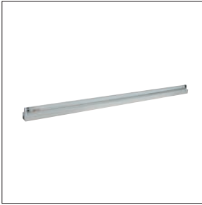
Fluorescent lamp FIA with complete electric installation 1x40W Code 019.010.110.000 EUR 15.00