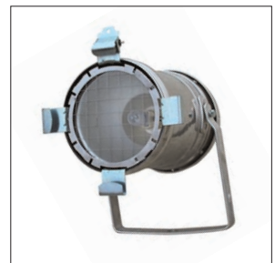
HIGHLIGHT HQI 150W reflector EUR 35.00 Code 019.010.390.000