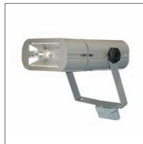
IVEN HQI 150W reflector EUR 35.00 Code 019.010.200.005