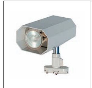
Halogen spotlight SY STAR 50W(A) EUR 15.00 Code 019.010.186.000