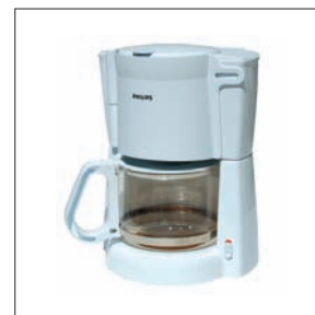
Coffee maker Code 025.010.120.010 EUR 4.00