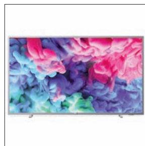
TV LED SMART 4K, UHD ultrathin (diagonal screen: 126 cm) Code 025 010 130 045 EUR 40.00/day