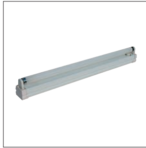
Fluorescent lighting SS30 type with D-170-A tube Code 019.010.190.001 EUR 18.00