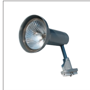
Halogen spotlight SY STAR 100W EUR 15.00 Code 019.010.185.000